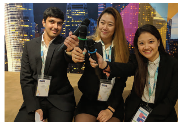
Attend the International Symposium on Advances in Technology Education