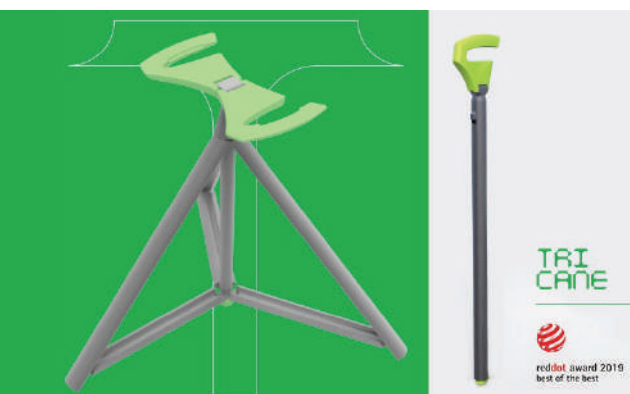
Prizewinning design concept honoured with "Red Dot: Best of the Best" award by HKDI student