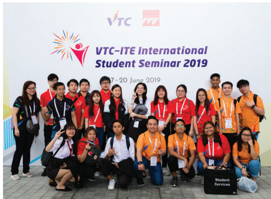
Biennial International Student Seminar jointly organised with the Institute of Technical Education (ITE) of Singapore