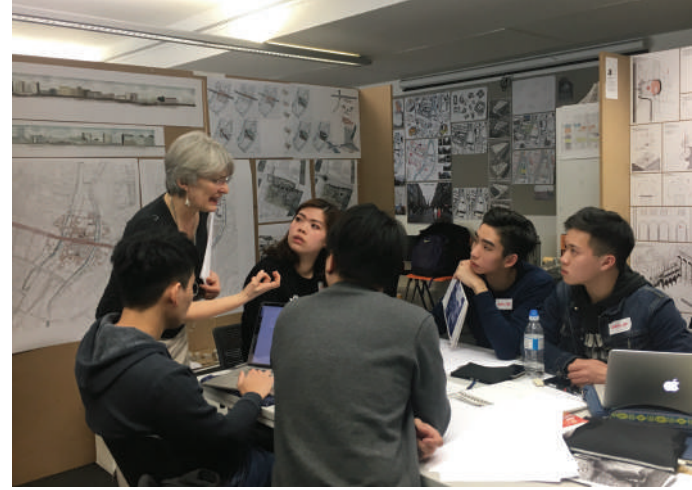
Design workshop in the University of Lincoln in the United Kingdom